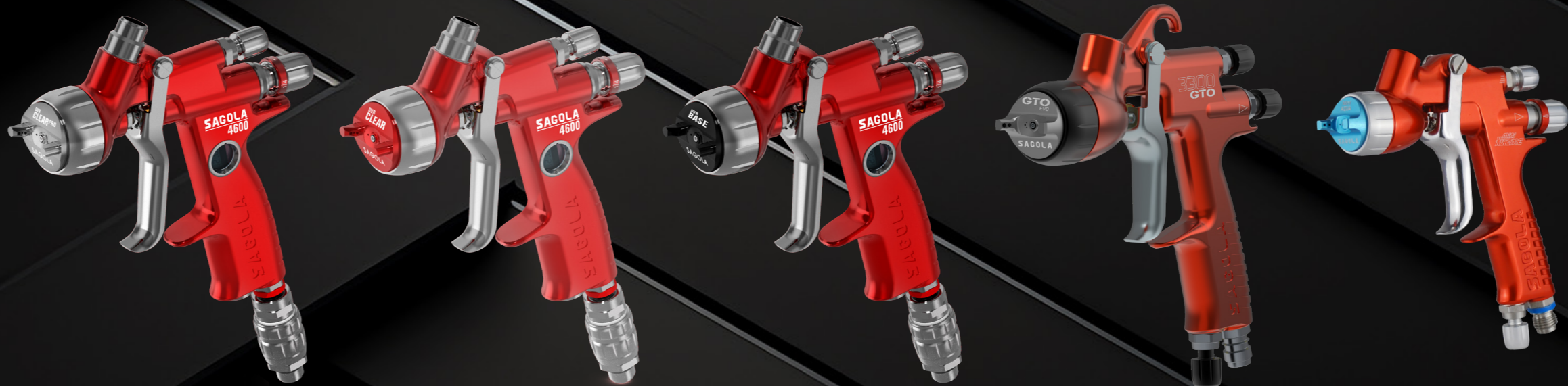
DVR CLEAR PRO SAGOLA 4600